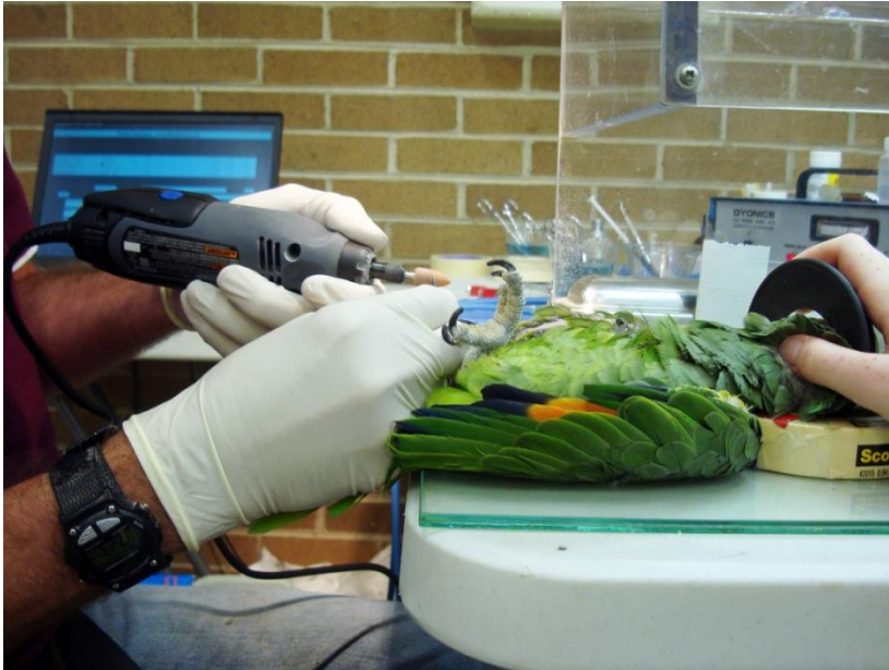
Trimming nails and smoothing out the edges with a Dremel tool.

sharp/blunt scissors in small birds and the White nail trimmer in large birds. Leg bands are removed using a precision leg band cutter (Kras by Veterinary Specialty Products).