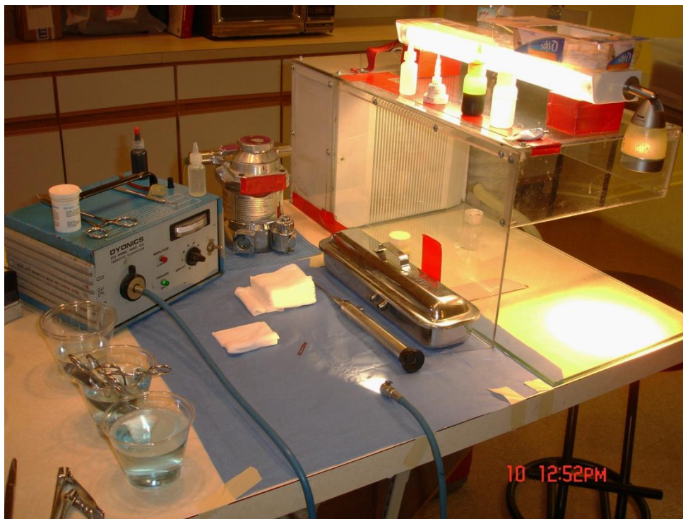
Table setup showing exhaust hood, lighting, vaporizer, sterile drape, and instruments

I use a smooth, plastic, portable table (Lifetime) purchased from an office supply store. It is 4 x 2 feet, which just fits in my car. The tabletop is impervious and easy to disinfect. I also bring my own folding chair. All procedures are done while seated.