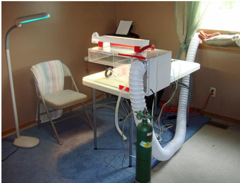
Florescent lighting on hood with LED spot light. Full spectrum floor lamp.

The room I work in will always have some type of overhead lighting present. I use an “under the cabinet” fluorescent hood light that is positioned on top of my exhaust box. In addition, I have a small LED spot light that is attached to the fluorescent light fixture. Lastly, I also use a full spectrum floor lamp.